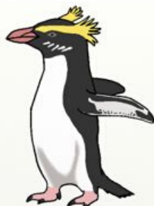
Fiordland Crested Penguin Eudyptes pachyrhynchus