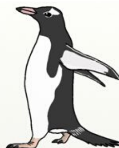
Gentoo Penguin Pygoscelis papua