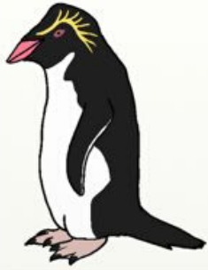
Southern Rockhopper Penguin Eudyptes chrysocome