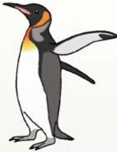
King Penguin Aptenodytes patagonicus