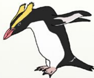
Erect-crested Penguin Eudyptes sclateri