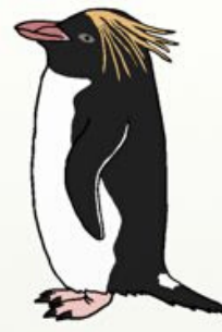
Macaroni Penguin Eudyptes chrysolophus