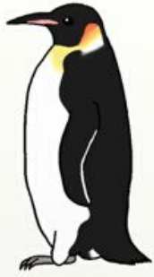
Emperor Penguin Aptenodytes forsteri