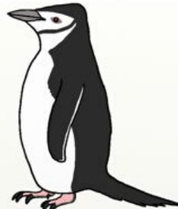
Chinstrap Penguin Pygoscelis antarctica