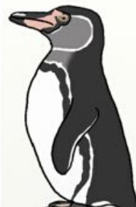
Galapagos Penguin Spheniscus mendiculus