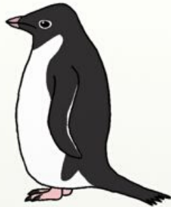
Adelie Penguin Pygoscelis adeliae