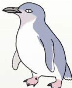
Little Blue Penguin Eudyptula minor