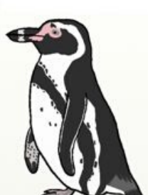
Humboldt Penguin Spheniscus humboldti