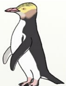
Yellow-eyed Penguin Megadyptes antipodes