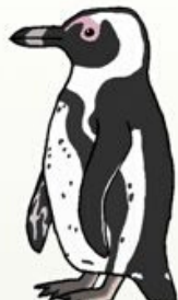
Jackass Penguin Spheniscus demersus