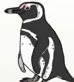
Magellanic Penguin Spheniscus magellanicus