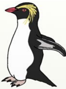
Northern Rockhopper Penguin Eudyptes moseleyi