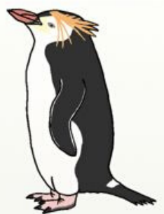
Royal Penguin Eudyptes schlegeli